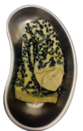
A very expensive sock that was removed from the intestines of a dog

So – as well as trying to ensure your pets don't eat these objects, we strongly recommend pet insurance to cover you against these unexpected eventualities!